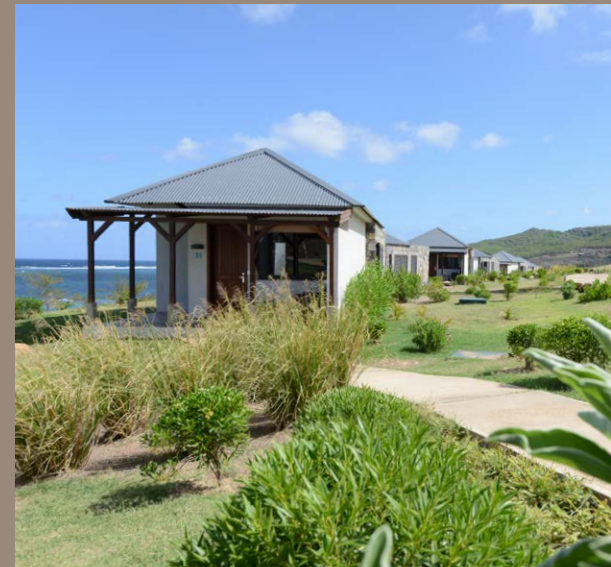
TEKOMA BOUTIK HOTEL