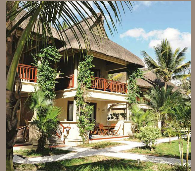
SAKOA BOUTIK HOTEL