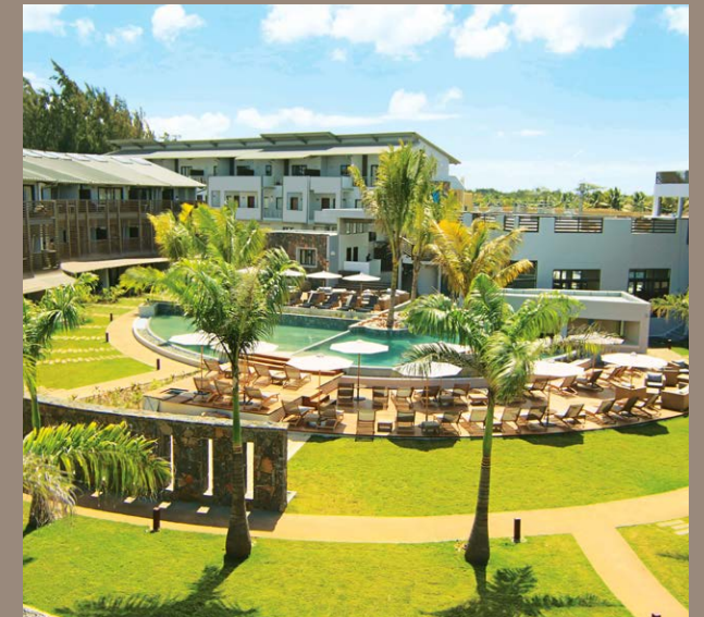
BE COSY APART' HOTEL