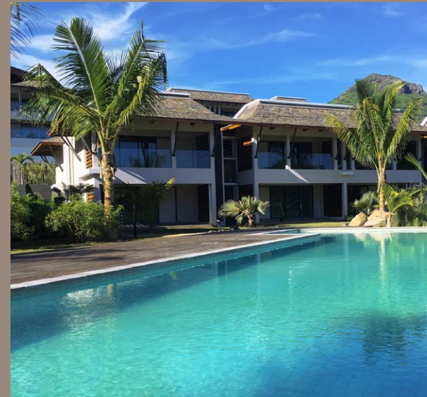
LES TERRASSES DU BARACHOIS